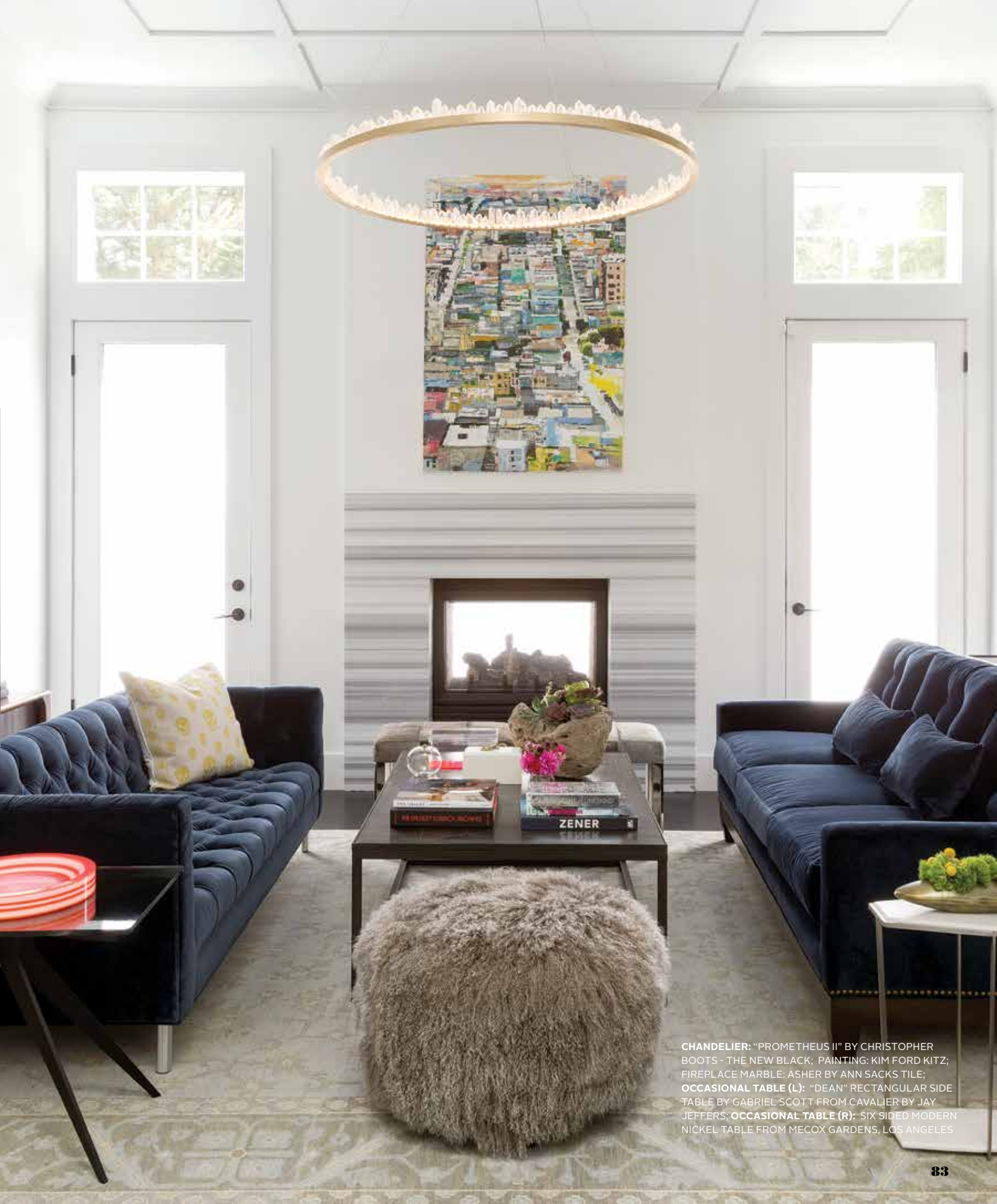
CHANDELIER: “PROMETHEUS II” BY CHRISTOPHER BOOTS - THE NEW BLACK; PAINTING: KIM FORD KITZ; FIREPLACE MARBLE: ASHER BY ANN SACKS TILE; OCCASIONAL TABLE (L): “DEAN” RECTANGULAR SIDE TABLE BY GABRIEL SCOTT FROM CAVALIER BY JAY JEFFERS; OCCASIONAL TABLE (R): SIX SIDED MODERN NICKEL TABLE FROM MECOX GARDENS, LOS ANGELES